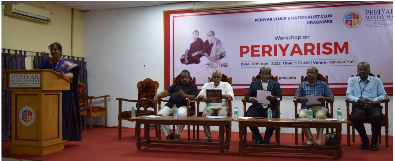
Workshop on Periyarism held at PMIST on 30.04.2022